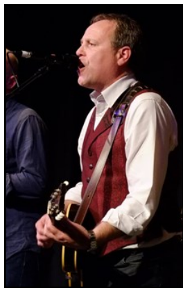
'Blues at the Apollo' returns on 29 April