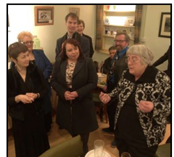
A good send-off for a lovely man.