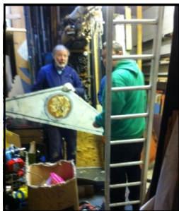
Anyone recognise this?