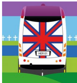
Coach Trip Origins Theatre

Arrangements will be as always: doors open 6.45 and tickets are £10, payable on the door.