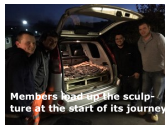
Members load-up the sculpture at the start of its journey

it was cast, for cleaning and re-patination. As you will see from the article elsewhere in this issue, the presentation of this wonderful gift has been overshadowed by the death of Lawrence Holofcener at the age of 91.